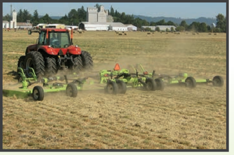
FX742 in grass straw