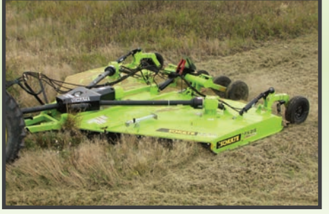
FX315 in set aside