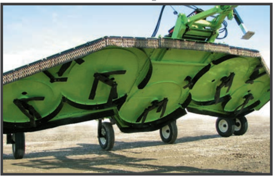
- Cutting width of 26' 2" (8 meters) - Average productivity at 7mph (11.3km/hr) = 22.06 acres/hr (8.93 hectares/hr)