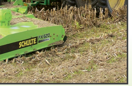
FX520 in corn