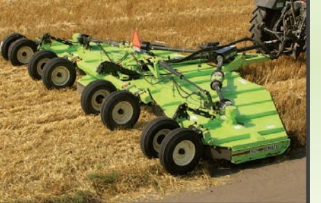
5026 in wheat straw