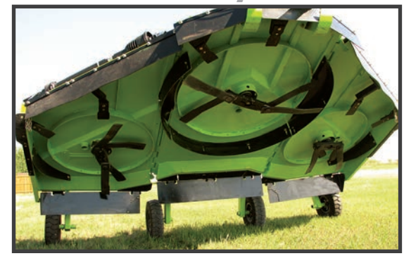
- Cutting width of 15' (4.5 meters) - Average productivity at 7mph (11.3km/hr) = 12.73 acres/hr (5.15 hectares/hr)