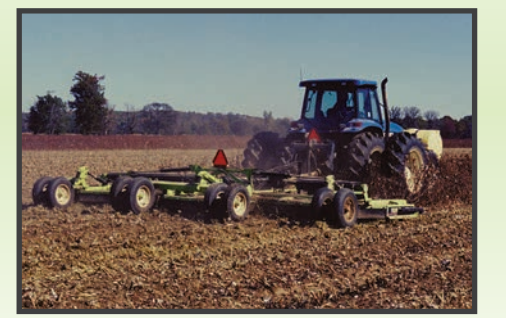
5026 in cotton