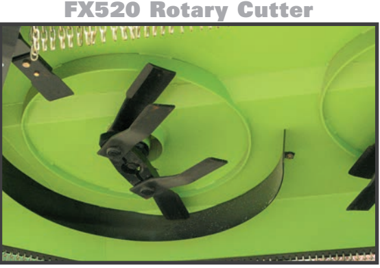
Close up of fixed knife technology with stationary mounted fixed knife and rear mounted baffle

#12 Fixed Knife units can also be used in orchard or vineyard