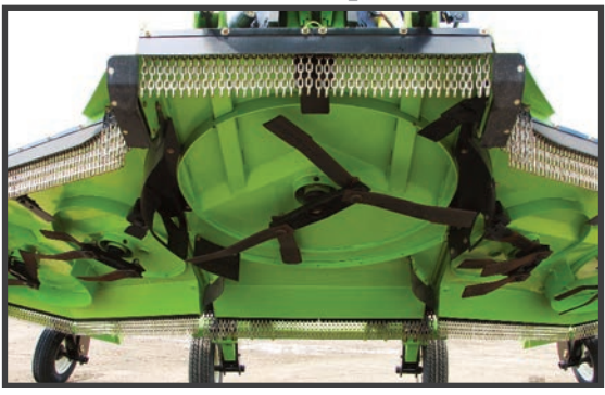
- Cutting width of 20' (6 meters) - Average productivity at 7mph (11.3km/hr) = 16.97 acres/hr (6.87 hectares/hr)