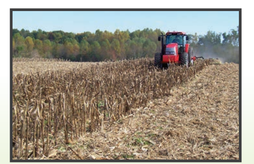
FX520 in corn